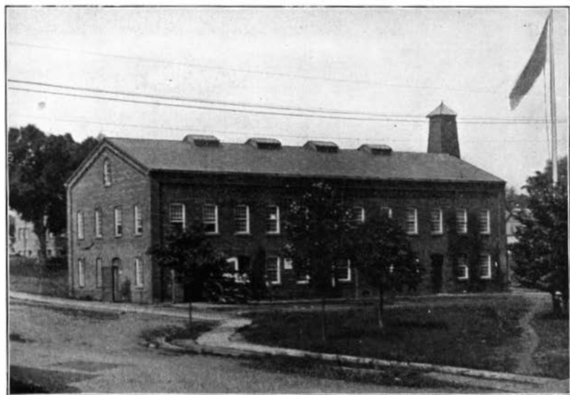
THE PARK HALL.