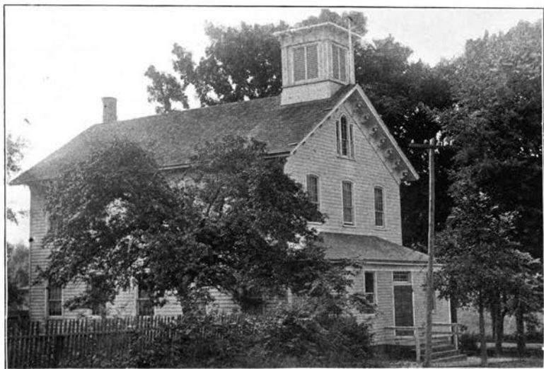
THE PASSAIC AVENUE SCHOOL.