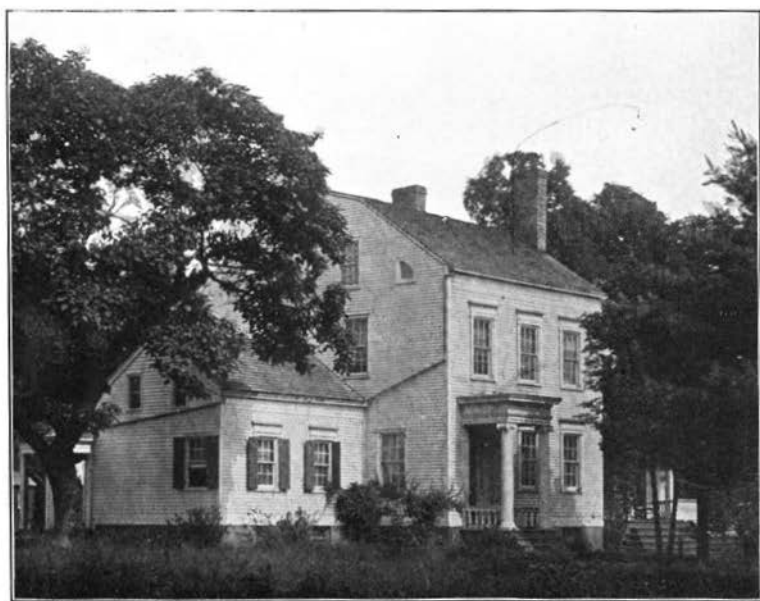
THE ELM STREET SCHOOL.