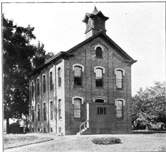
THE CHURCH STREET SCHOOL.